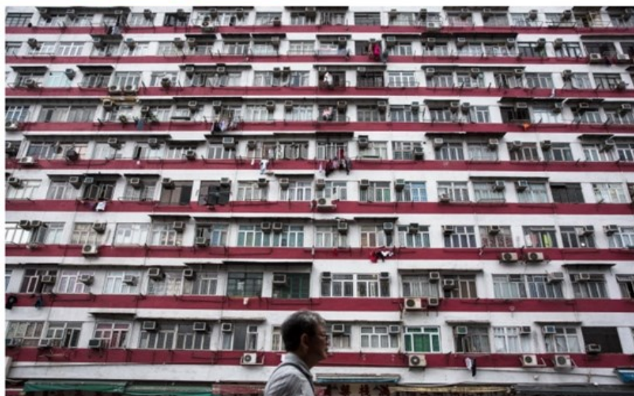
Expenses in Hong Kong can really add up.